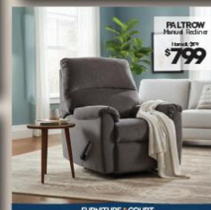
FURNITURE + COURT