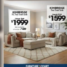
FURNITURE + COURT