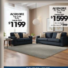
FURNITURE + COURT