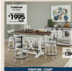
FURNITURE + COURT